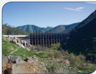
Del Dios Gorge