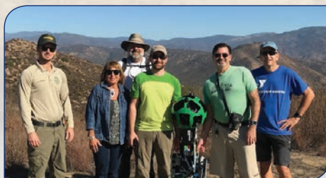
Hiking with the Google Trekker is a team effort! We took turns wearing the device as it took 360-degree images of the trail.