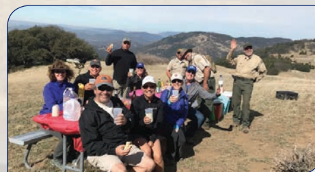
The weather cooperated for Valentine's on Volcan this year, and 20 hikers made the trek to the summit, where they enjoyed a picnic lunch and wine tasting.