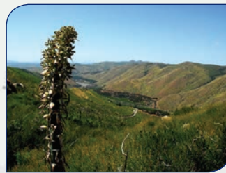
San Pasqual Valley