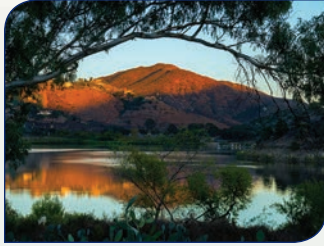
Bernardo Mountain

Our current habitat restoration projects are located at: