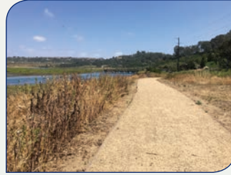
River Path Del Mar