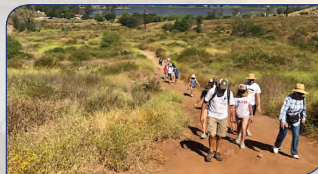
We recruited 6 new Hike Assistants and Leaders—all eager to introduce more people to the River Park!