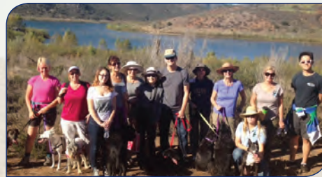
Dog owners love sharing the trails with their pets. We collect food/treat donations for the Helen Woodward Animal Center at our Furry Friends Hikes.