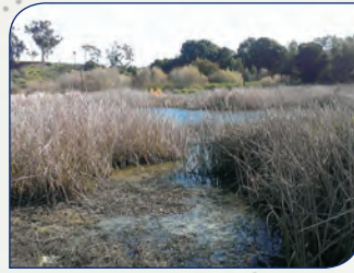
Lagoon Pond (adjacent to the San Dieguito Lagoon/Estuary complex)