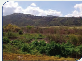
San Pasqual Valley