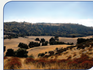
Santa Ysabel Gorge