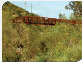
Del Dios Gorge