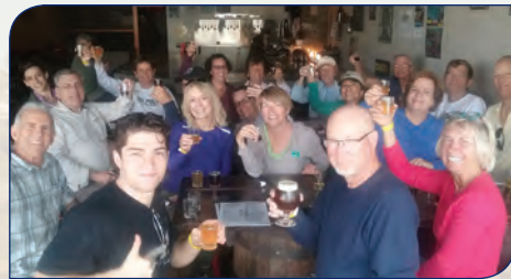
Trails & Ales has recently wrapped up its third round, and we're planning to expand the series in the fall.