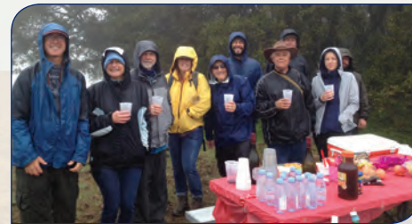
Hikers braved wind, rain, and low temps for this year's Valentine's on Volcan—the wine and picnic at the summit was well-deserved!