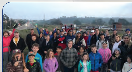
Family-friendly Full Moon Hikes typically attract 30-60 hikers eager for a unique look at the River Park in moonlight.